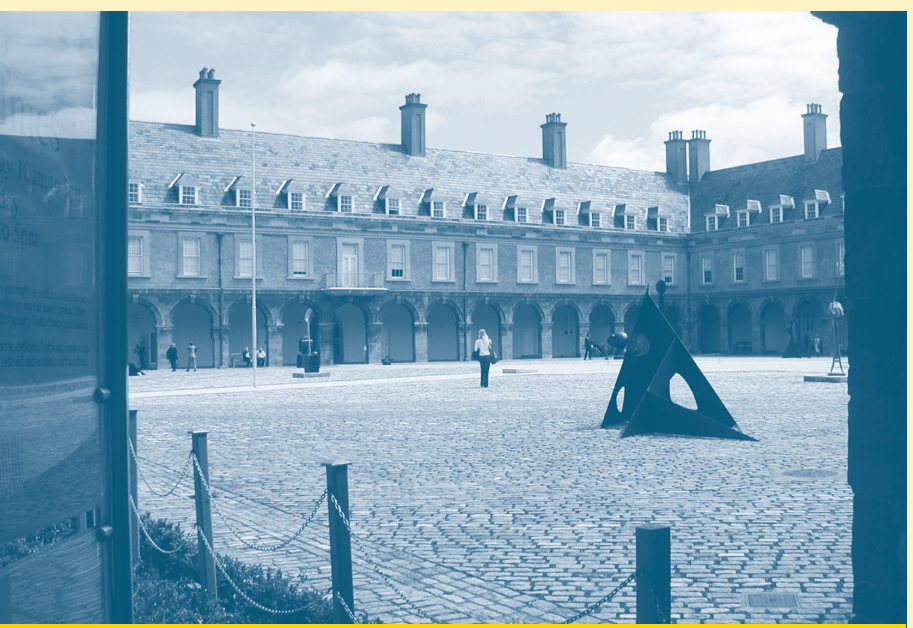
THE ROYAL HOSPITAL KILMAINHAM